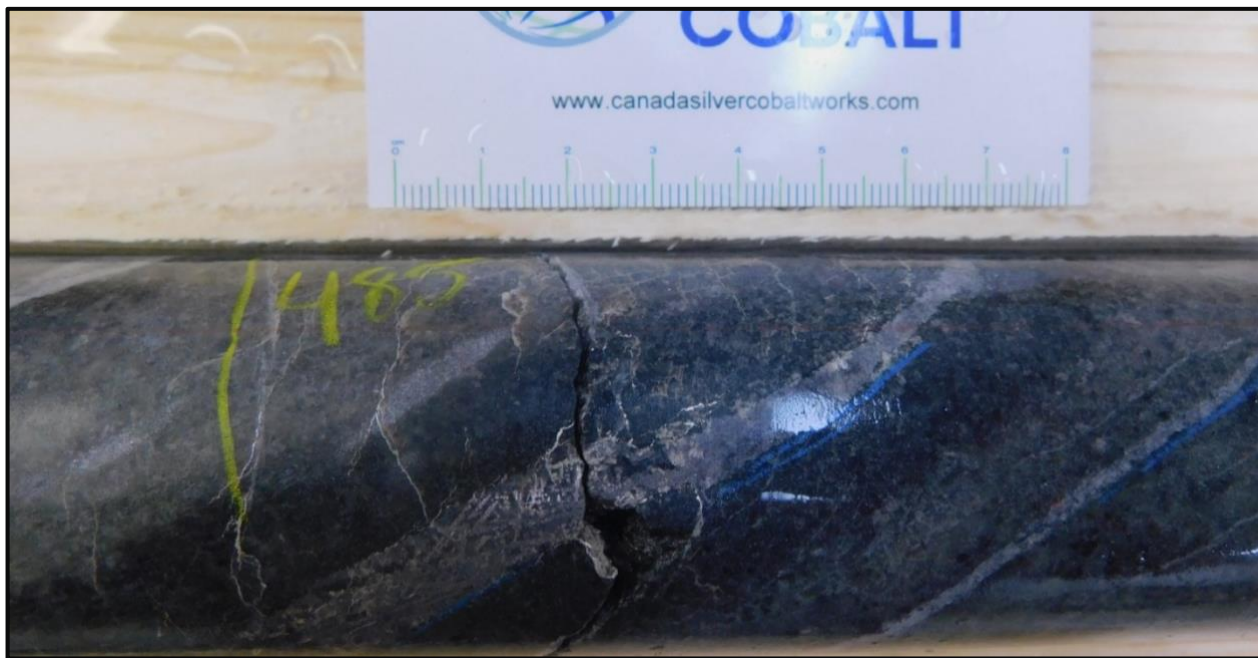
Figure 1: Silver and cobalt mineralization in hole CS-21-54 (7,981 g/tonne Ag)